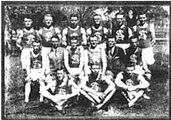
South Australian Race Walking Club - Champions of Australia 1930